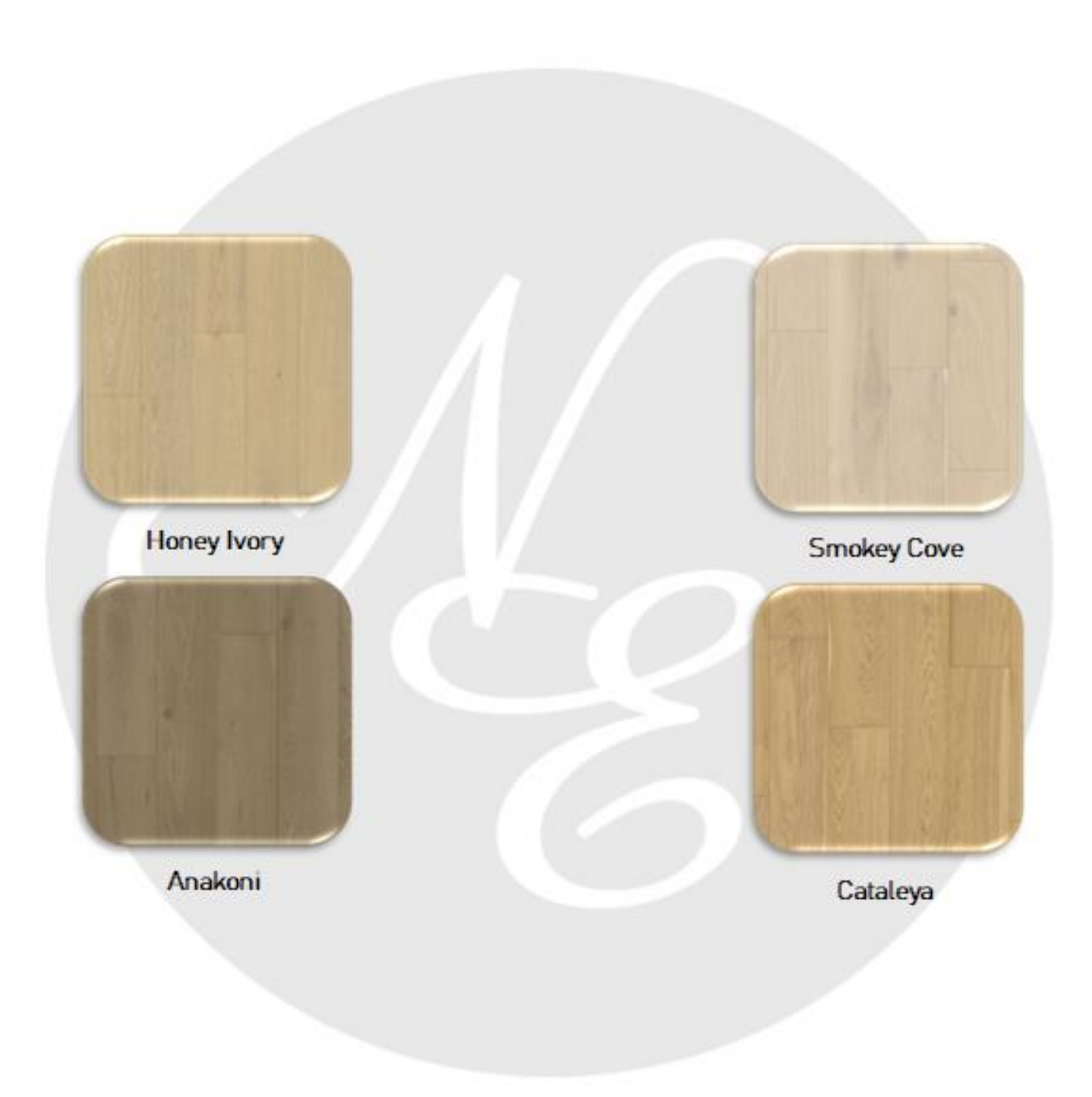
4 New Colors Coming Soon