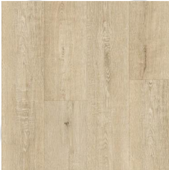
IST105 Ashmont Hill