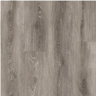
IST104 Cedar Grove