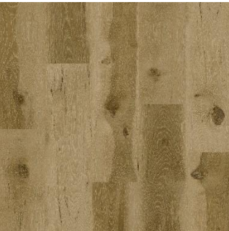
IST113 Sunset Cliff