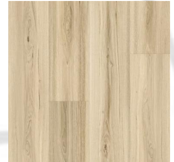
IST106 Gold Creek