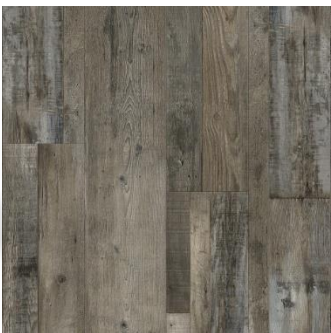
IST107 Glen Canyon