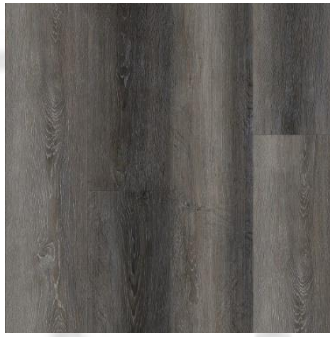
IST102 Black Forest