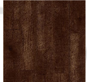
IST114 Mission Bay