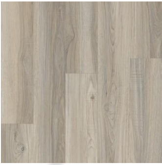
IST101 Bass River