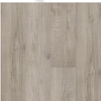
IST110 Northside Park