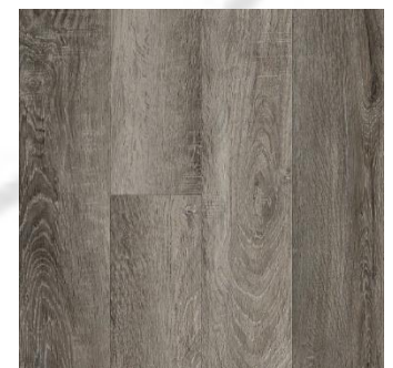
IST112 Terra Vista