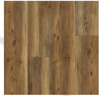
IST103 Fort Point