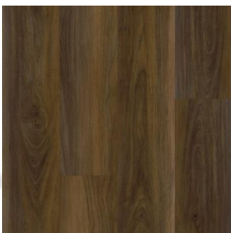
IST111 Stone Ridge