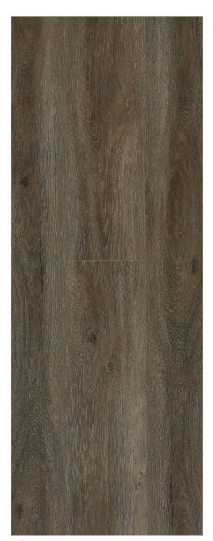
★18011 RECLAIMED SUMMER