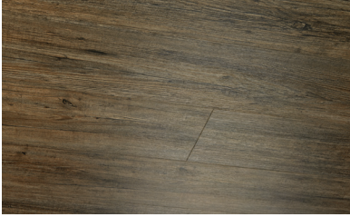
CHEVALIER PINE COCHE7P5MM-18