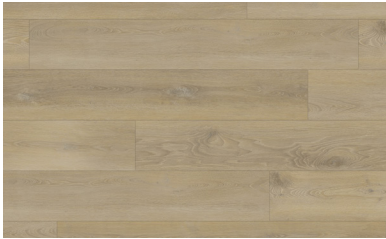
CAMARILLA OAK COCAM9O5MM-19