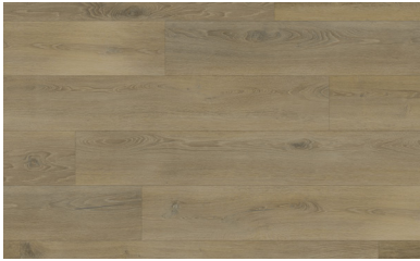
CHANCELLOR OAK COCHA9O5MM-19