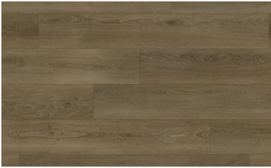
ROHAN OAK COROH9O5MM-19