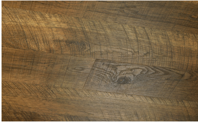
MONARCH HICKORY COMON7H5MM-18