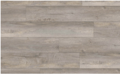
STEWARD OAK COSTE9O5MM-19