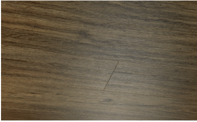
SOVEREIGN OAK COSOV7O5MM-18