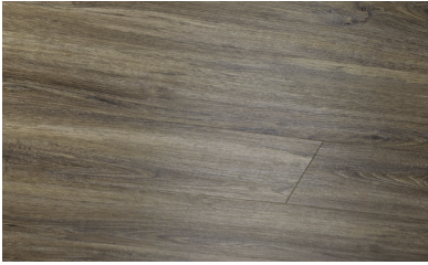
IMPERIAL OAK COIMP7O5MM-18