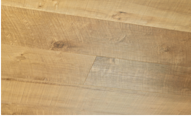
ESQUIRE MAPLE COESQ7M5MM-18