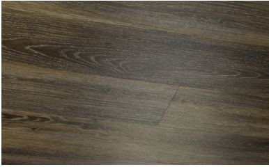
PALADIN OAK COPAL7O5MM-18