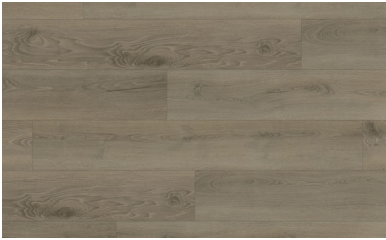
FALCONER OAK COFAL9O5MM-19