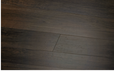
MARGRAVE TEAK COMAR7T5MM-18