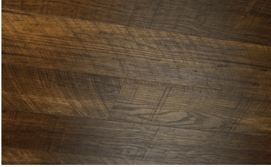
BARONESS HICKORY COBAR7H5MM-18