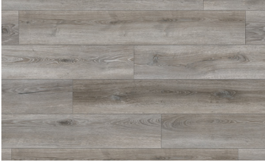
ROYAL OAK COROY9O5MM-19