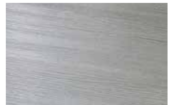
■ Chatham Walnut