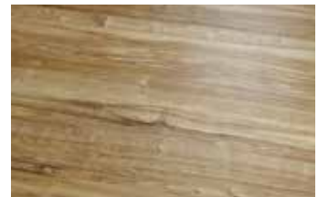
■ Springfield Birch