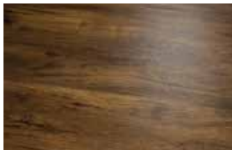
■ Lexington Pecan