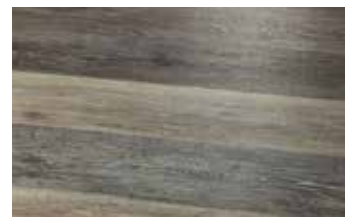
■ Concord Oak