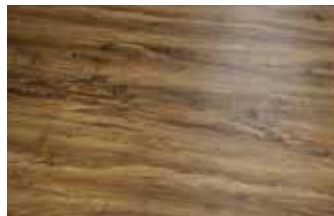
■ Appalachian Birch