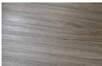
■ Pumilla Elm