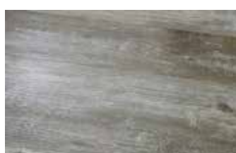
■ Arcadian Oak