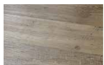
■ Chaminade Oak