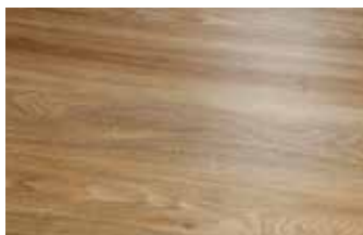
■ Portsmouth Oak