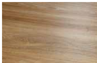
■ Cumberland Cedar