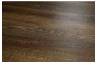
■ Shenandoah Oak