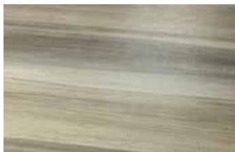
■ Charleston Oak