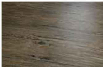
■ Smoky Mountain Pine